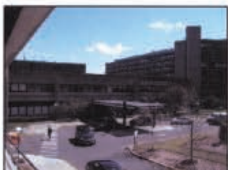
N. Dental School (DS)