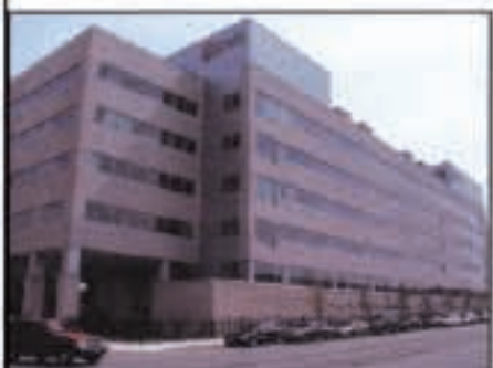
E. Ambulatory Care Center (ACC)