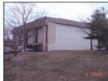
L. George F. Smith Library (LIB)