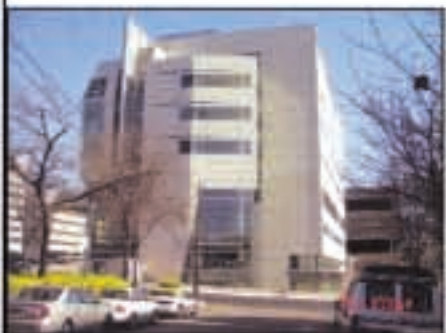
I. Cancer Center (CC)