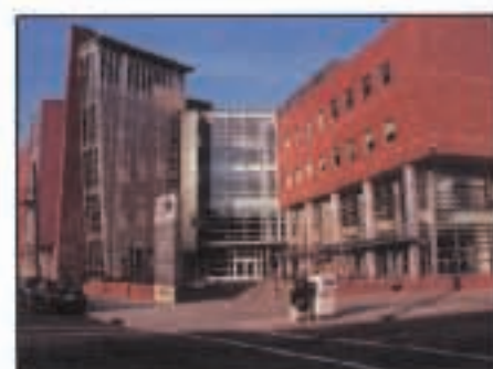
S. International Center for Public Health (ICPH)