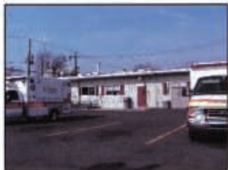
C. Emergency Medical Services Building (EMS)