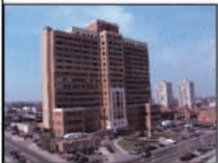
A. Stanley S. Bergen, Jr. Building (SSB)