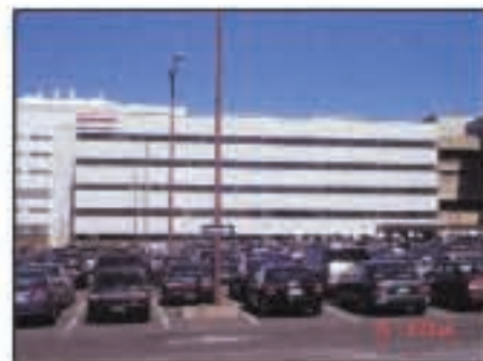
K. Behavioral Health Sciences Building (BHSB)