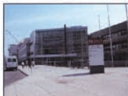
O. 12th Avenue Pavilion (Dental School Expansion)