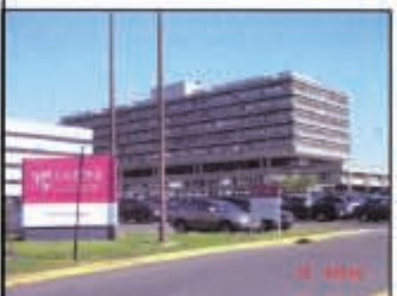
M. Medical Science Building (MSB)