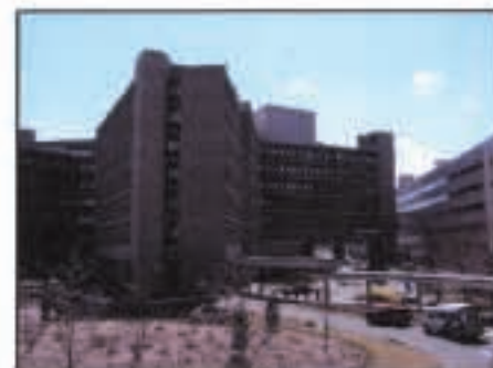
H. University Hospital (UH)