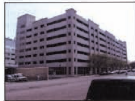
D. Parking Deck P2 (P2)