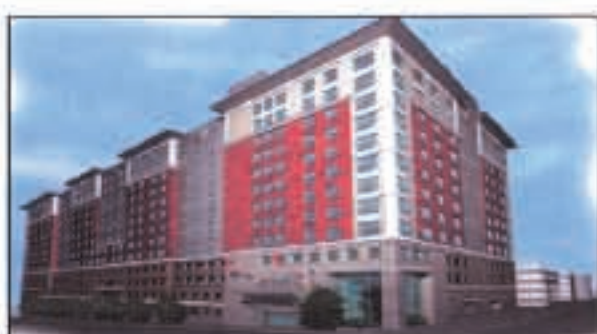
R. University Housing