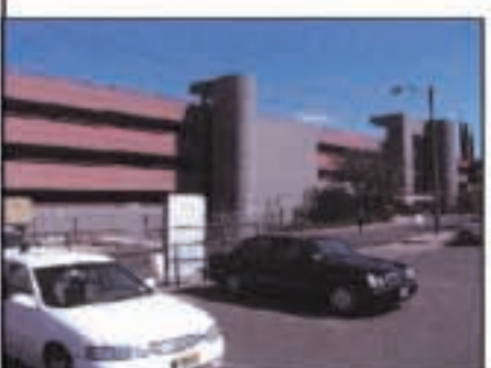
Q. PARKING DECK P1 (P1)