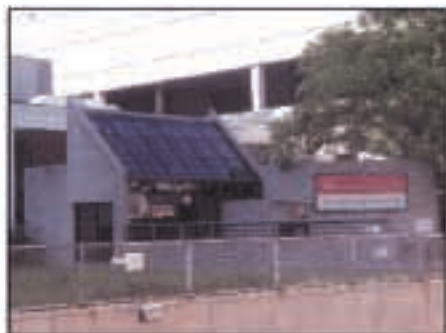
J. Radiation Oncology