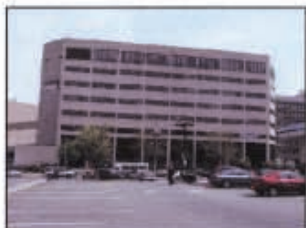
F. Doctors Office Center (DOC)