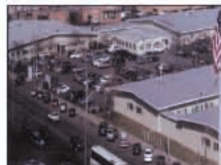
P. Administrative Complex (ADMC)