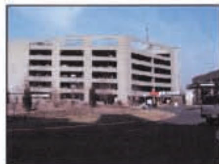
G. Parking Deck P3 (P3)